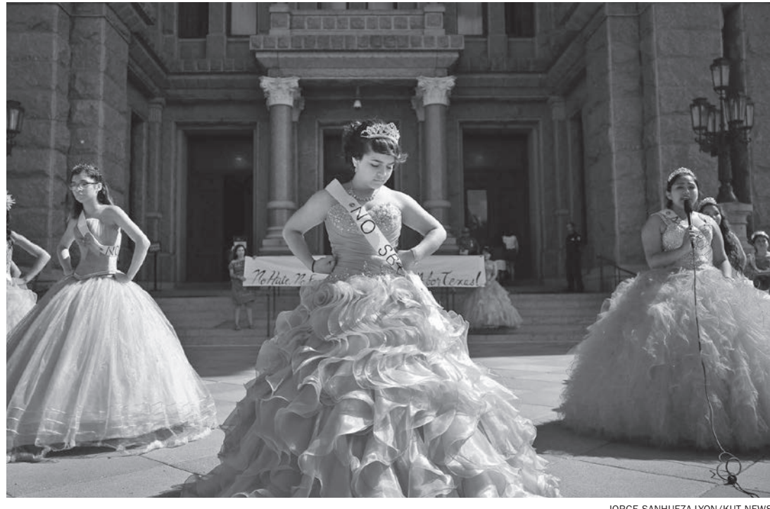
Protesters dressed in brightly colored quinceañera dresses get in formation, preparing to blockade a government building with a "wall of floof."

Organizers said they took inspiration from two action guides published after the midterm elections. "Indivisible on Offense," released on November 18, 2018 by the nationwide network that played a key role in spurring grassroots Congressional advocacy during Trump's time in office, provided strat-