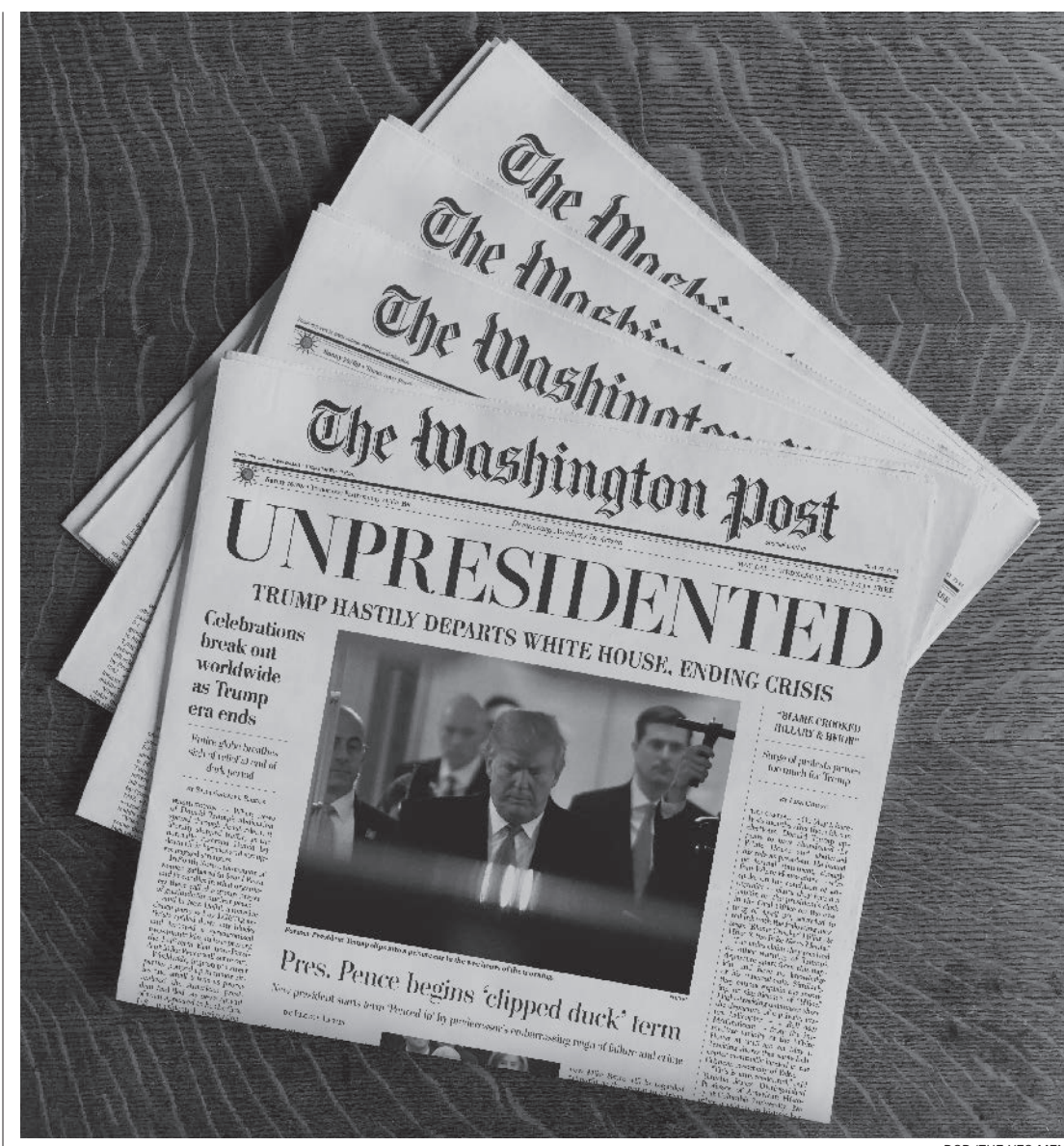
The faux Washington Post seemed amusing when it landed in January, but in retrospect its coverage of early 2019 was borderline spooky.