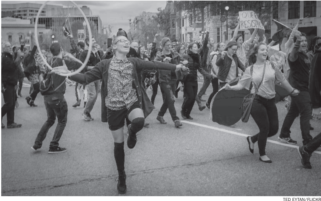
Impromptu celebrations, like this LGBTQ dance party in Amsterdam, broke out all around the world after news spread that Donald Trump had fled the White House and abandoned the presidency.