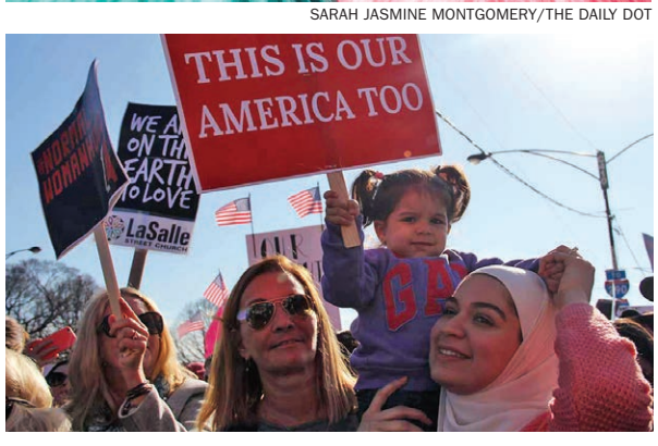
Top: Teenagers used dresses to blockade offices. Bottom: Americans flooded the streets nationwide.

time really massive numbers of us marched over the Brooklyn Bridge to protest outside Chuck Schumer's apartment," she said, referring to the Senate Minority Leader. Wood was part of an action on February 14 in which 15,000 people crowded the streets of the mostly residential neighborhood of Park Slope, Brooklyn. "Instead of going to Times Square or Trump Tow-er," said Wood, "we took it home. Schumer and other Democratic leaders had sometimes talked a good line, but they didn't start doing anything to counter Trump until they became the target of highly focused popular pressure."