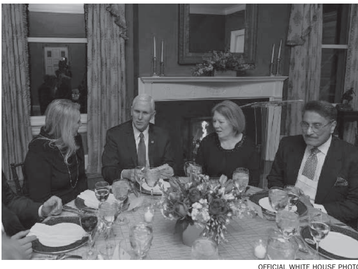
Seemingly unruffled by events, Pence enjoys a quiet family dinner.

Trump's star power, and you're left with Pence's position.