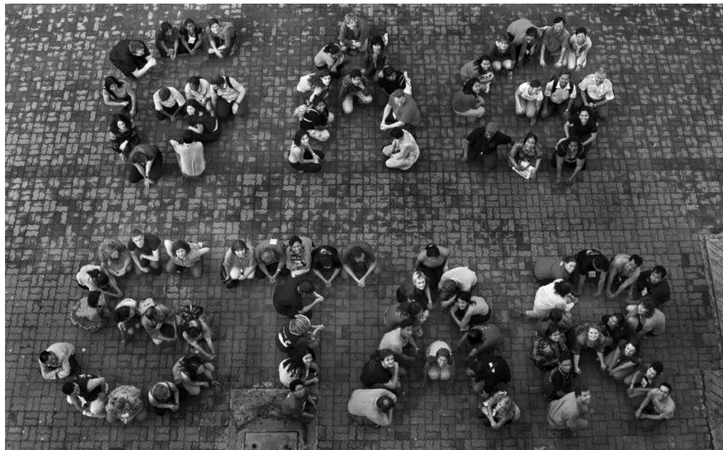
CCC network members called on the jeans brand G-Star to stop being a "Gag Star" at the International Campaign Forum in Bangkok. At the time, G-Star was the major buyer at FFI.

For a current and detailed update regarding the case, please visit our website at www.cleanclothes.org/urgent/ffi.htm . We expect to give a fuller picture of the status of the case in a future edition of this newsletter.