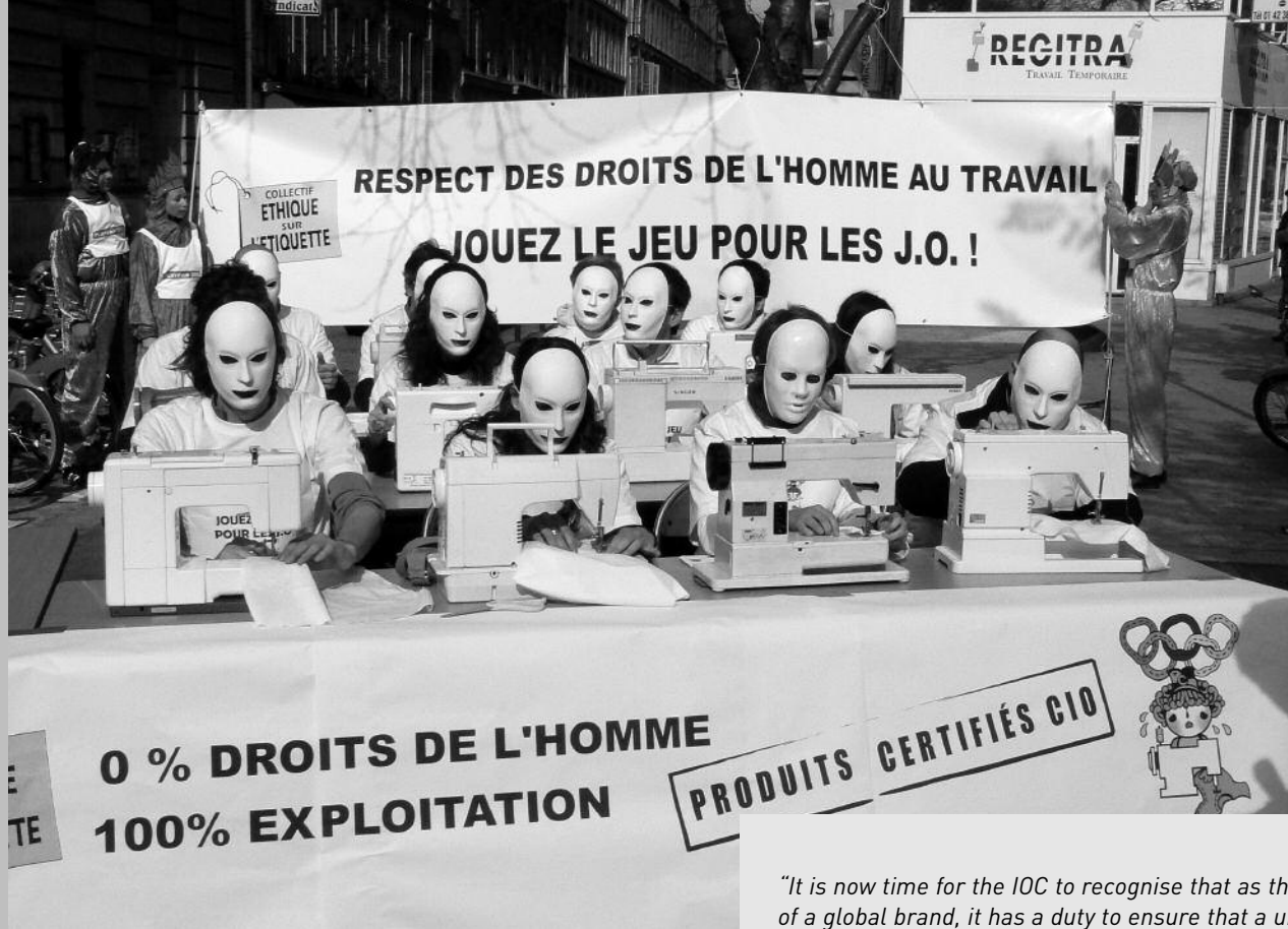
Paris street action connected with the launch of the Play Fair campaign in France: "Jouez le jeu pour les JO".