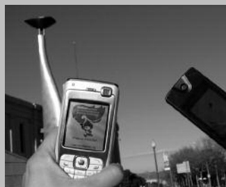
Spanish activists use their phones to catch the virtual flame for labour rights.