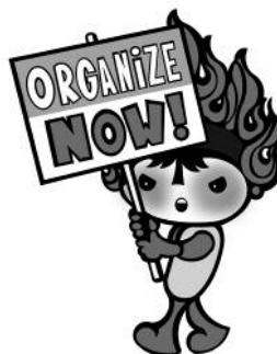
One of the Play Fair campaign's "labour rights fuwas"; this one supports workers' right to organize.

Play Fair has linked several of the fuwas to key rights that workers in Olympic and sportswear supply chains are demanding including a living wage, freedom of association and the right to a safe and healthy workplace.