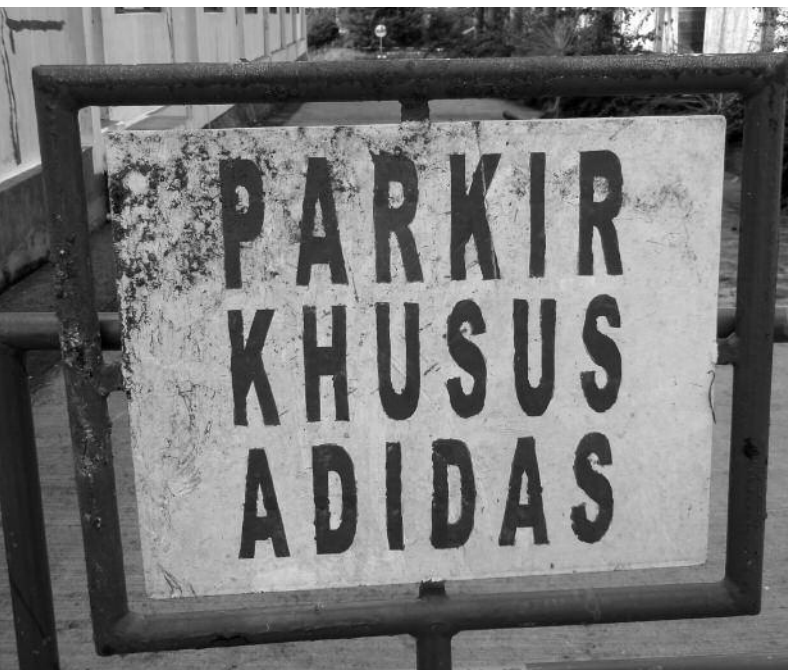
Adidas' parking spot at the closed Spotec factory in Indonesia, where workers were refused their full legal entitlements.