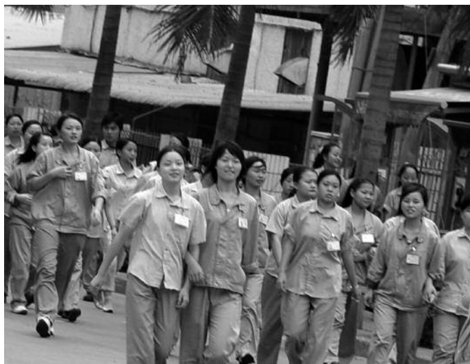
China's new Labour Contract Law came into force on January 1, 2008.

In the run up, the country saw unprecedented levels of labour unrest and mass lay-offs. The new law requires employers to guarantee the jobs of workers with more than ten years of experience until their official retirement age. In response, there have been reports of widespread factory closures and shedding of long-term employees.