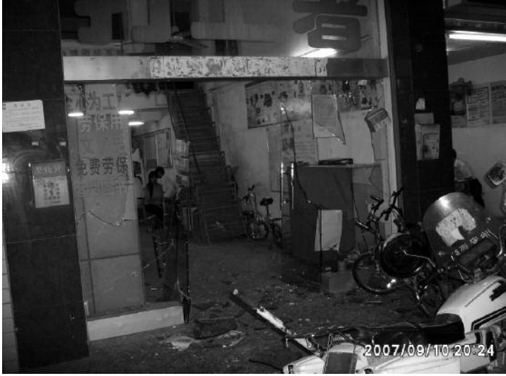
The office of the DGZ Migrant Worker Centre in Shenzhen after it was ransacked. The Centre re-opened in February.