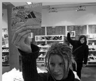
German CCC action at an adidas shop in Berlin.

"Once I rented my cooking gas cylinder to arrange some money for a health emergency suffered by my wife. The situation is similar for all of us. One of my friends even sold his blood to get some extra money to meet an emergency." - 50-year-old worker who stitches soccer balls in India