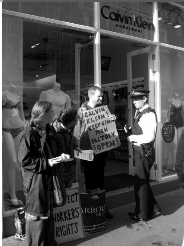
CCC mobilises in support of workers at the Gina Form Bra Factory in Thailand.

In very specific situations, and only after exhausting all other possibilities, we may ask a sourcing company to