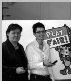
Austrian CCC passes the virtual Play Fair torch.

"It is now time for the IOC to recognise that as the owner of a global brand, it has a duty to ensure that a uniform and robust approach is taken by host cities to ensure that those goods that they procure bearing the Olympics logo have been made in work-places that meet the highest employment standards."