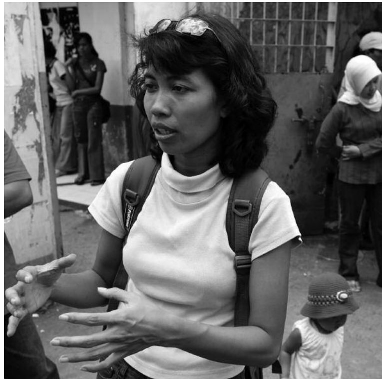
Parkati, a former employee of FILA's sport shoe supplier PT Tae Hwa in Indonesia, fought to get workers' back-pay and severance pay after the factory suddenly closed.

"Sector-Wide Solutions for the Sports Shoe and Apparel Industry in Indonesia", CCC and Oxfam Australia, 2008. Available at: http://www.cleanclothes.org/ftp/080320_Sector-Wide_Solutions_in_Indonesia.pdf