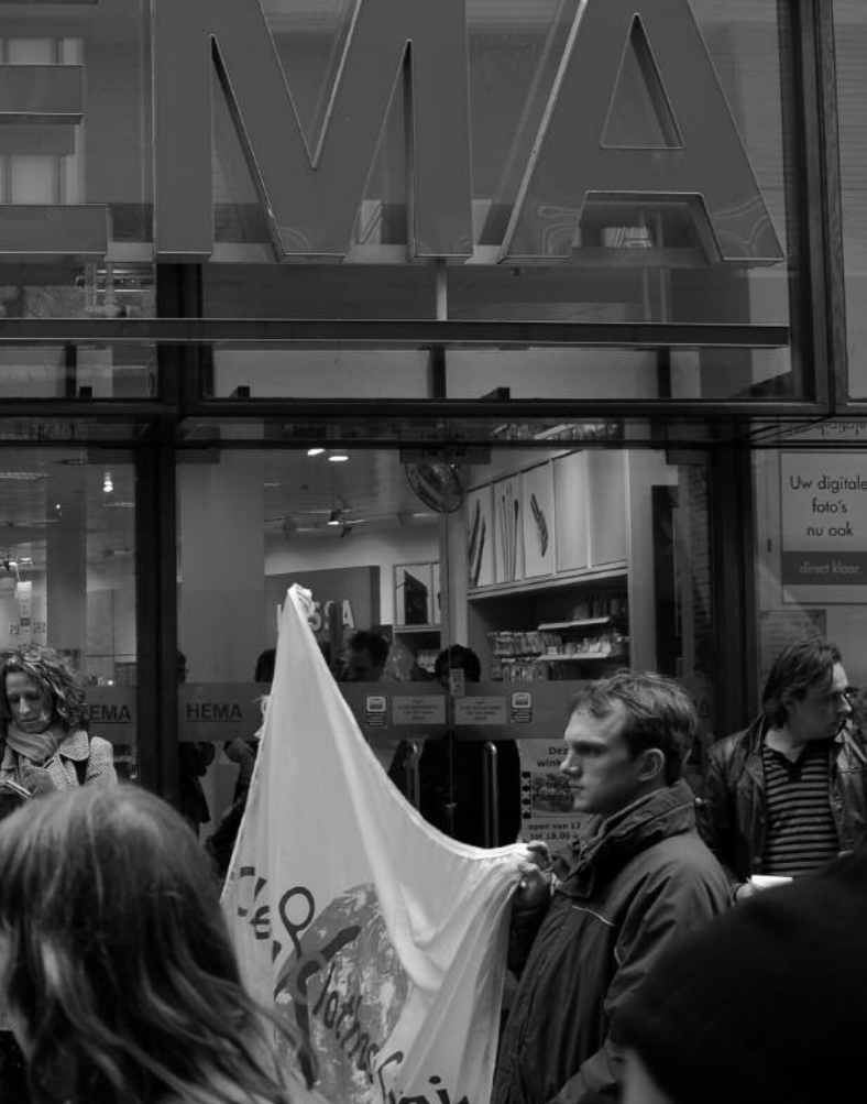
Schone Kleren Kampagne demonstration in 2006 in response to Bangladesh factory fires passes the country's most popular retailer HEMA.

One of the most important activities in the first years was the building of an international network. The demands and priorities of workers' organisations in producer countries formed the basis of SKK's work, so it developed close and frequent contact with them. Trips were made and meetings organized to stimulate this.