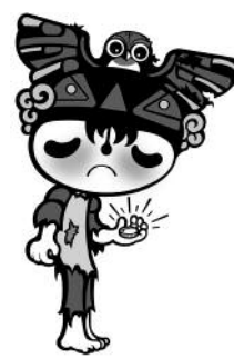
The Play Fair campaign is calling upon the sportswear industry to pay workers a living wage.